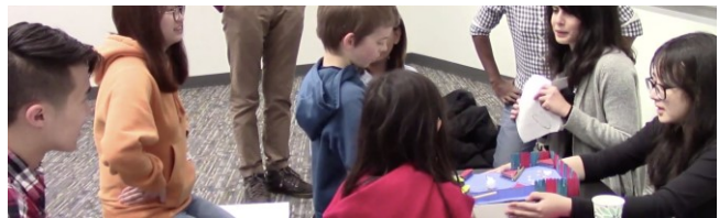
Figure 4. Children playing with pinball machine (Session 4).

disruptive to the designers’ plans, these children were providing valuable feedback (whether recognized or not). In Yue’s case, the child was absorbed by playing with their pinball prototype—demonstrating engagement and providing ample opportunity for observational analysis (Figure 4). Often, however, the HCI students were focused on how they personally believed children should interact based on their protocol.