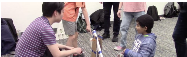
Figure 3. Children exploring uses of the trebuchet (Session 1).

When children started using prototypes, they often did so in unexpected ways. For example, children attempted to eat the chia seeds initially brought for an experiment (Session 3) and repeatedly threw large objects using an early-stage trebuchet prototype (Figure 3, co-design Session 1). HCI students had difficulty responding and adapting to this unexpected behavior, which sometimes led to frustration, demoralization, and a feeling of lack of control. Stephan, a member of the Trebuchet team, said: “As designers it really challenged our concept of affordances... they would make use of anything that they would see in the way they wanted to... they used the trebuchet to throw projectiles at the windmill... that was not what we were expecting.”