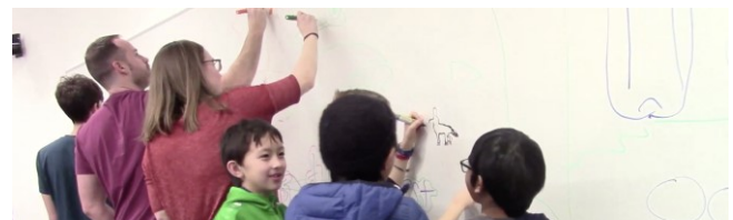
Figure 2. Children and students during snack time (Session 3).

Building rapport between designers and users [61] is a critical component of participatory design [19, 34, 37]. The Cooperative Inquiry [33] method, in particular, allocates the first 15 minutes of a design session for establishing rapport: an informal “snack time” for designers and users to eat and talk together and a “circle time” share, which serves both as a formal introduction and ice breaker. Despite this structure, we observed that a majority of HCI students did not focus on rapport building, especially in their first set of sessions. For example, during “snack time,” the HCI students self-segregated and communicated amongst themselves, rather than talking with the children (Figure 2). In “circle time,” some HCI students felt uncomfortable revealing information about themselves to the group, which was intended to strengthen connections. For example, Dale said, “ I didn’t like talking about my age because I’m 37. I’m there with 19-year-olds, but it was cool. Everyone talked about their age. ”