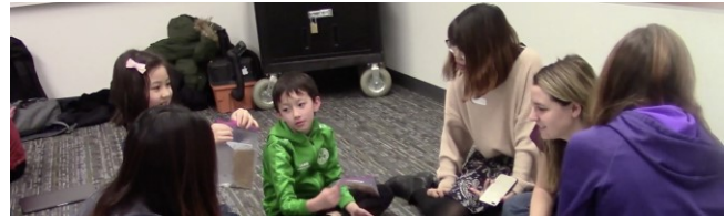
Figure 5. Children comparing bags of seeds (Session 3).

occurs as the group made a decision that appeared to be not equal to a child user. Biya’s team expected children to be able to wait patiently (a perfectly reasonable request), but they did not recognize that by giving one child the bag with the more curious seeds, the session created a less than exciting experience for the other child holding a bag of seeds.